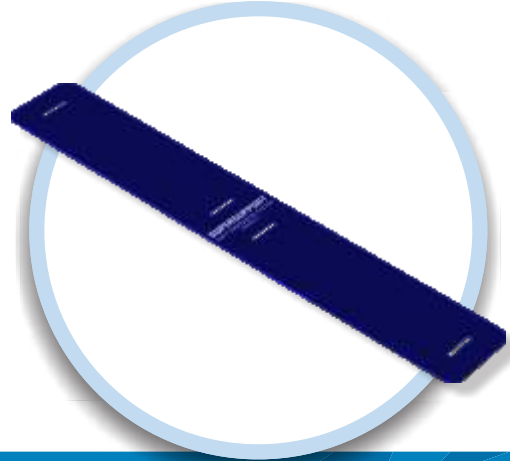
DSSS - Strap